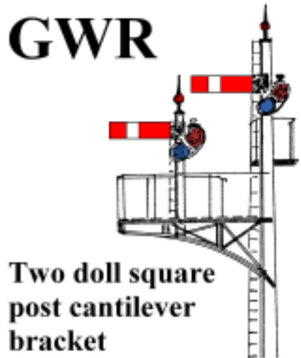
Two doll square post cantilever bracket

Universally adaptable for tee brackets, 4 doll and gallows signals. Includes backing arm and goods line ring.